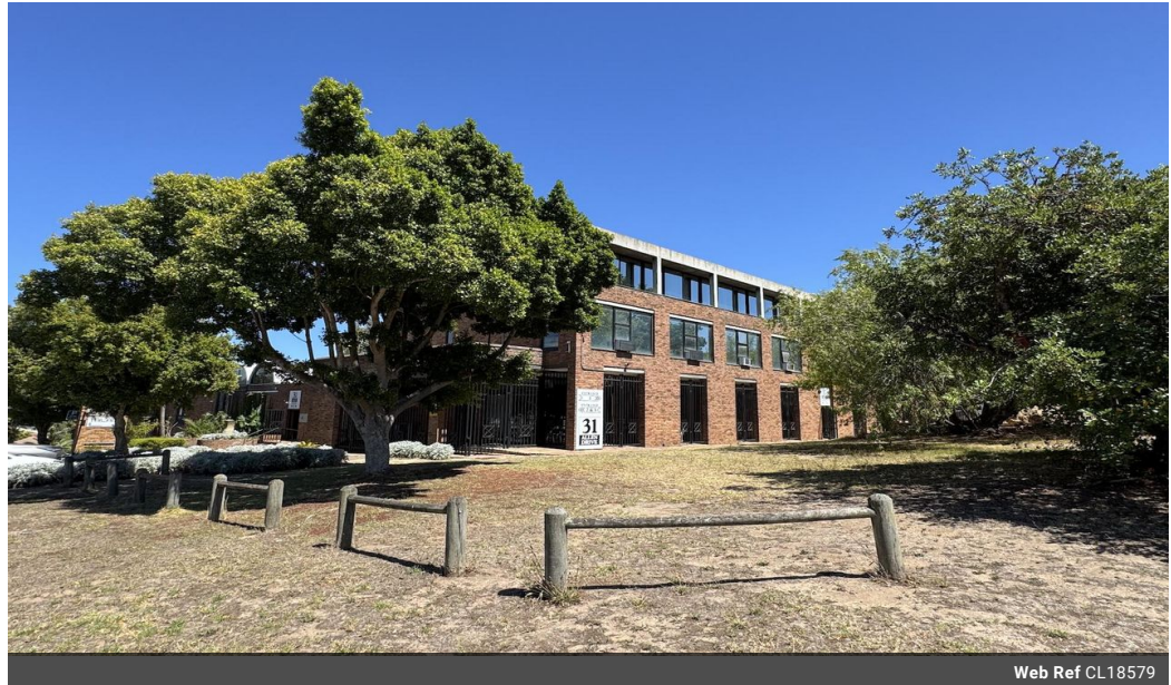
Web Ref CL18579