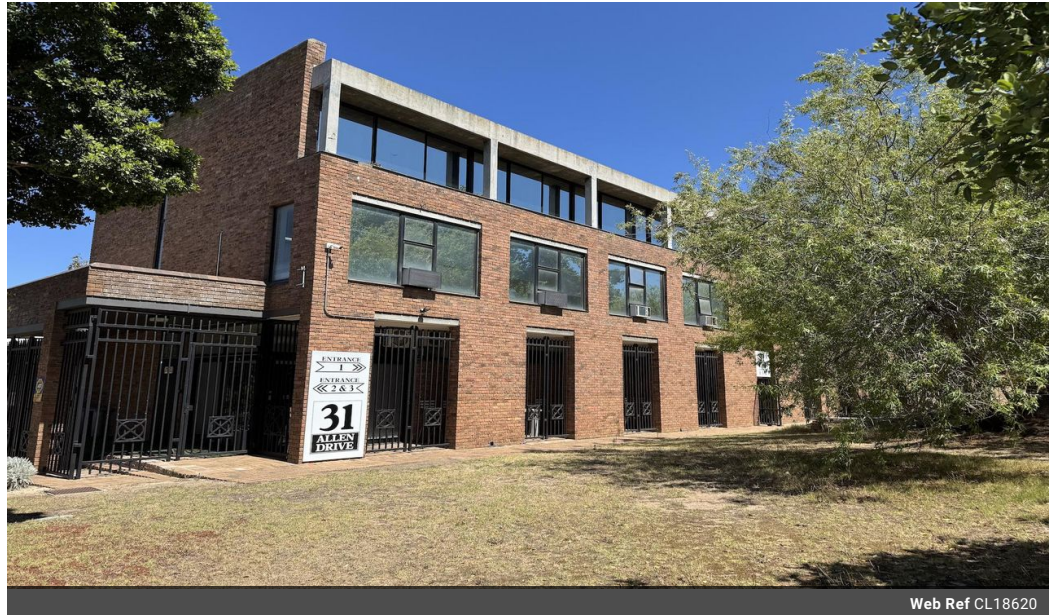
Web Ref CL18620