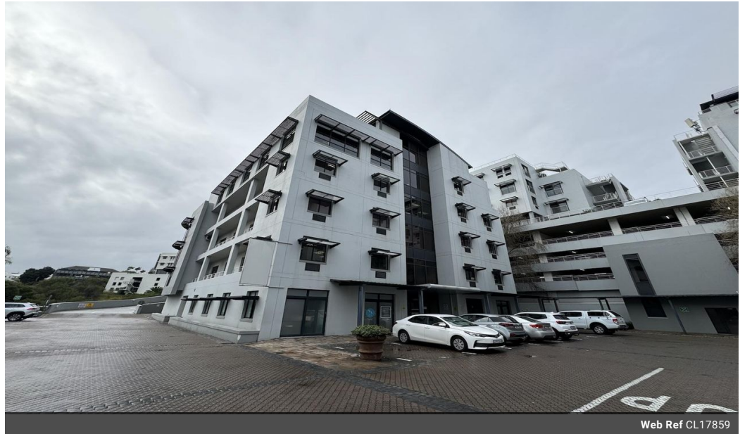
Web Ref CL17859