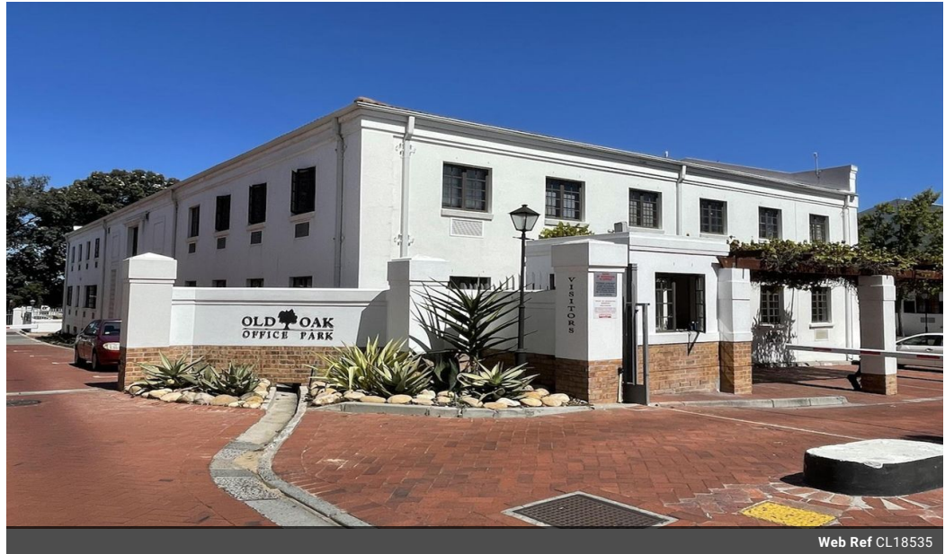
Web Ref CL18535