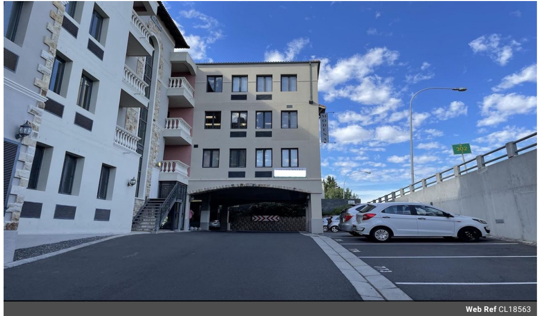
Web Ref CL18563