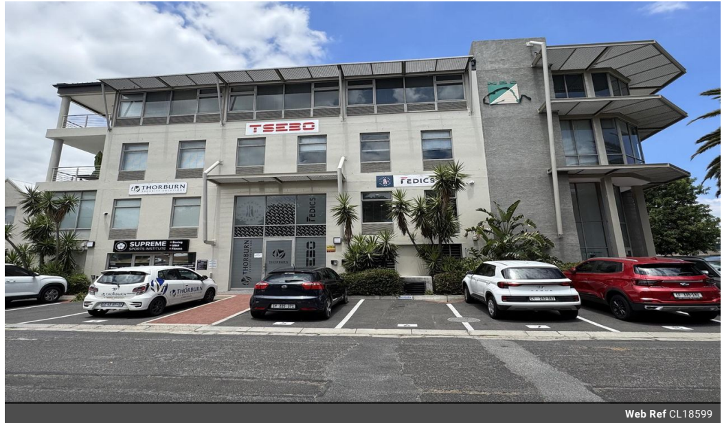
Web Ref CL18599