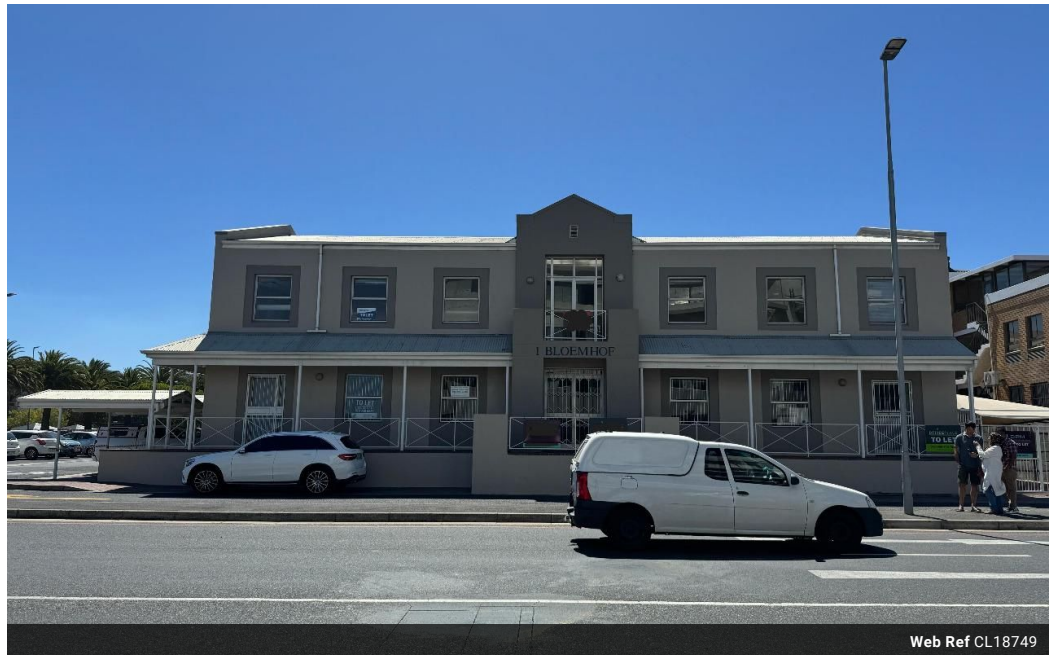
Web Ref CL18749