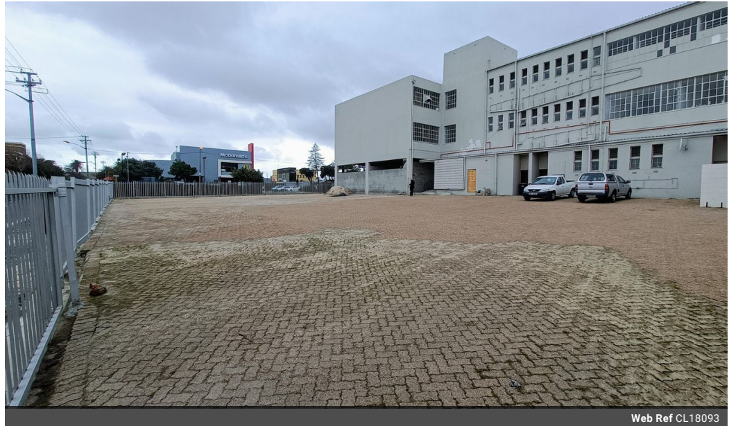
Web Ref CL18093