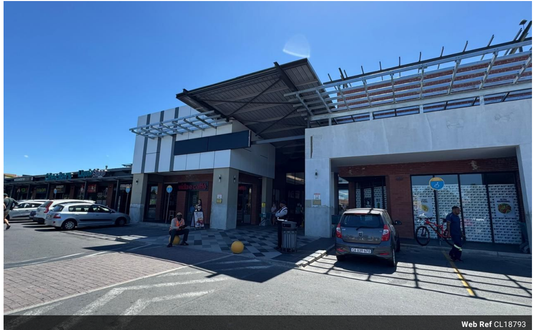
Web Ref CL18793