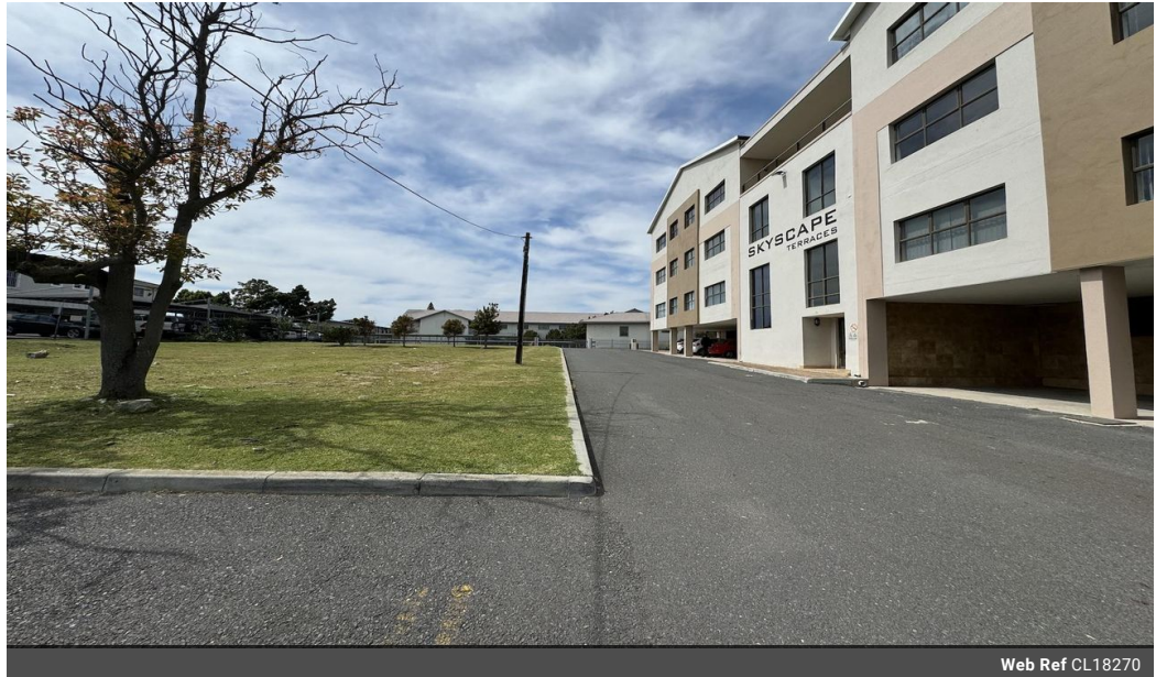
Web Ref CL18270