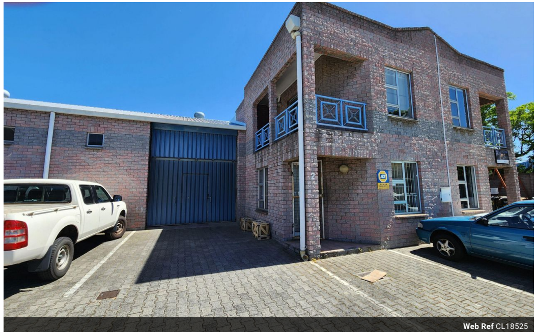
Web Ref CL18525