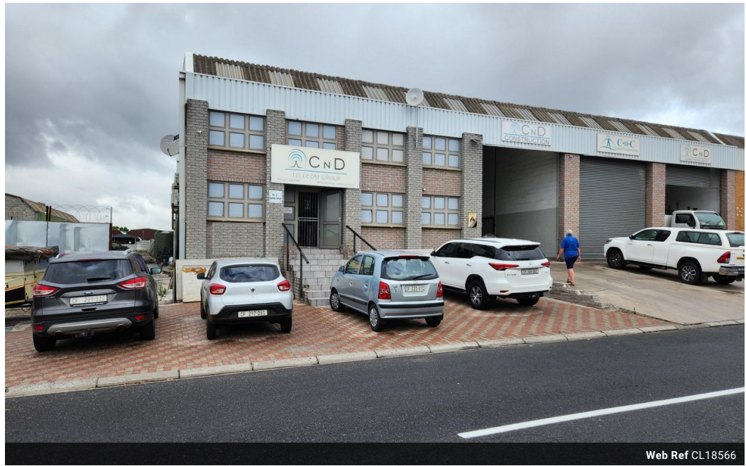
Web Ref CL18566