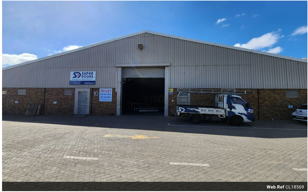
Web Ref CL18569