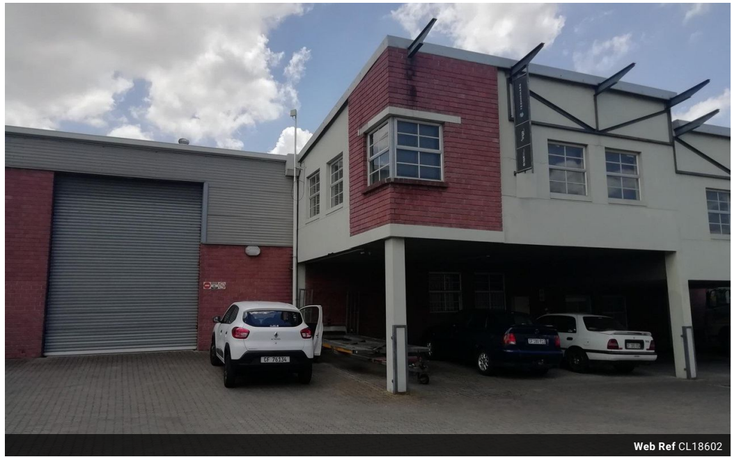
Web Ref CL18602