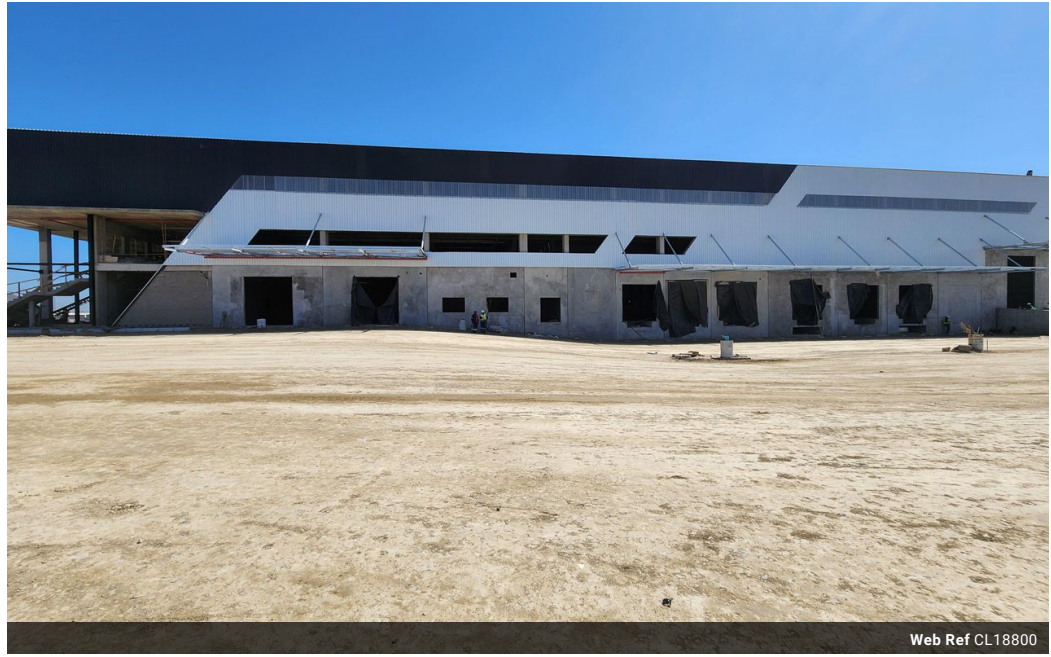
Web Ref CL18800