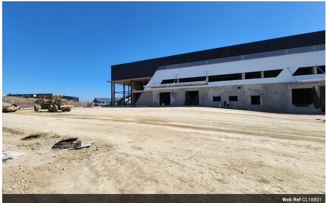
Web Ref CL18801