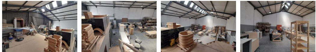
Web Ref CL18819