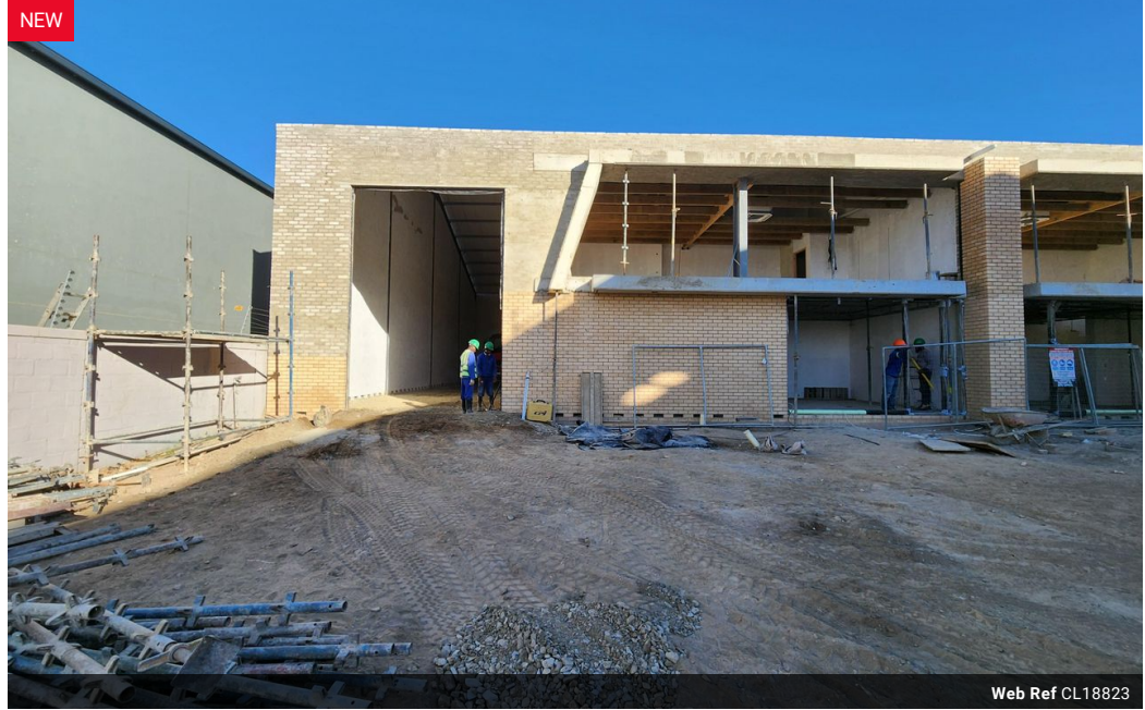
Web Ref CL18823