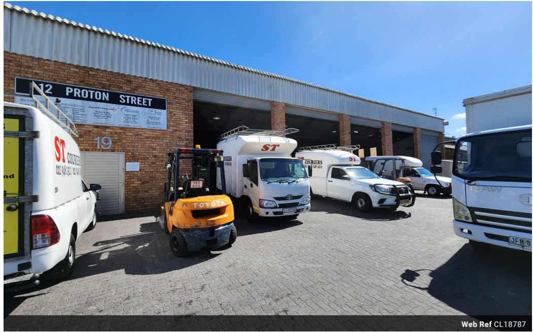
Web Ref CL18787