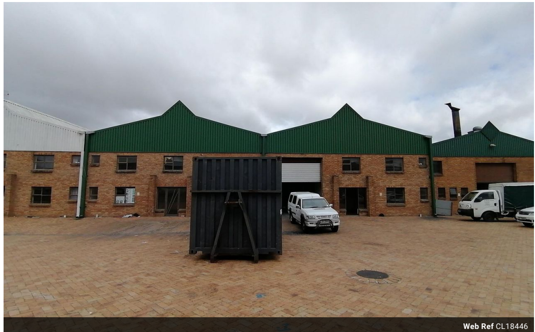
Web Ref CL18446