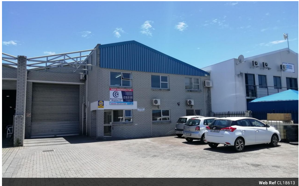
Web Ref CL18613