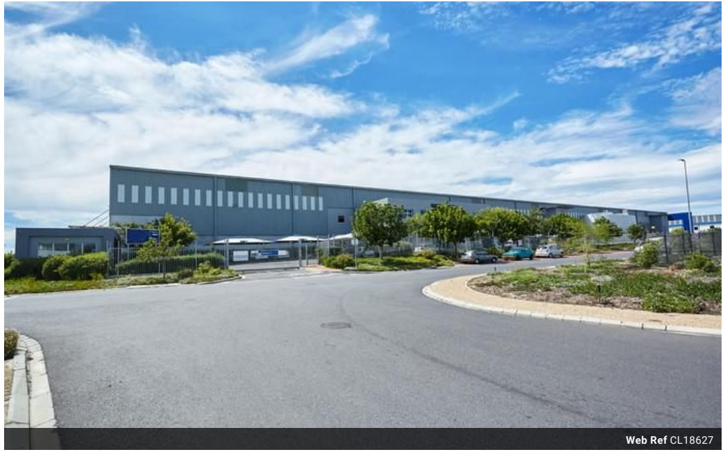
Web Ref CL18627