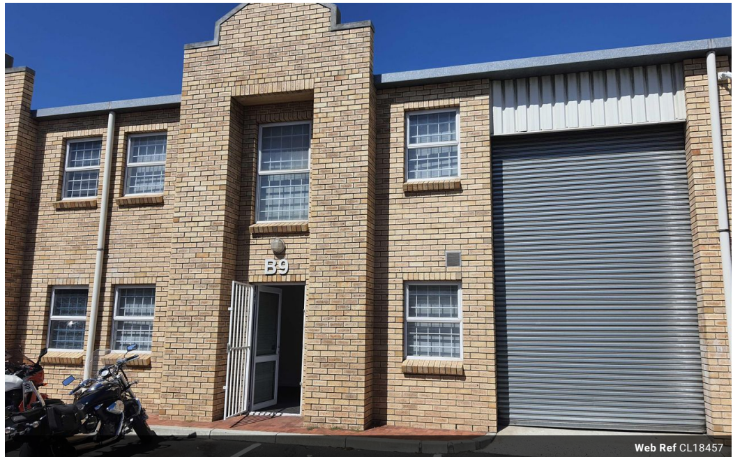
Web Ref CL18457