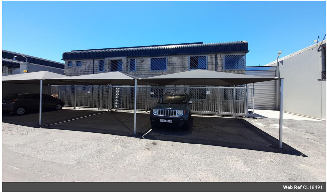
Web Ref CL18491