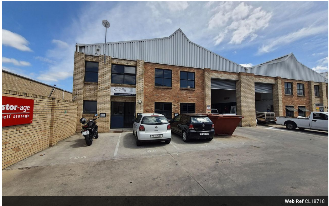
Web Ref CL18718