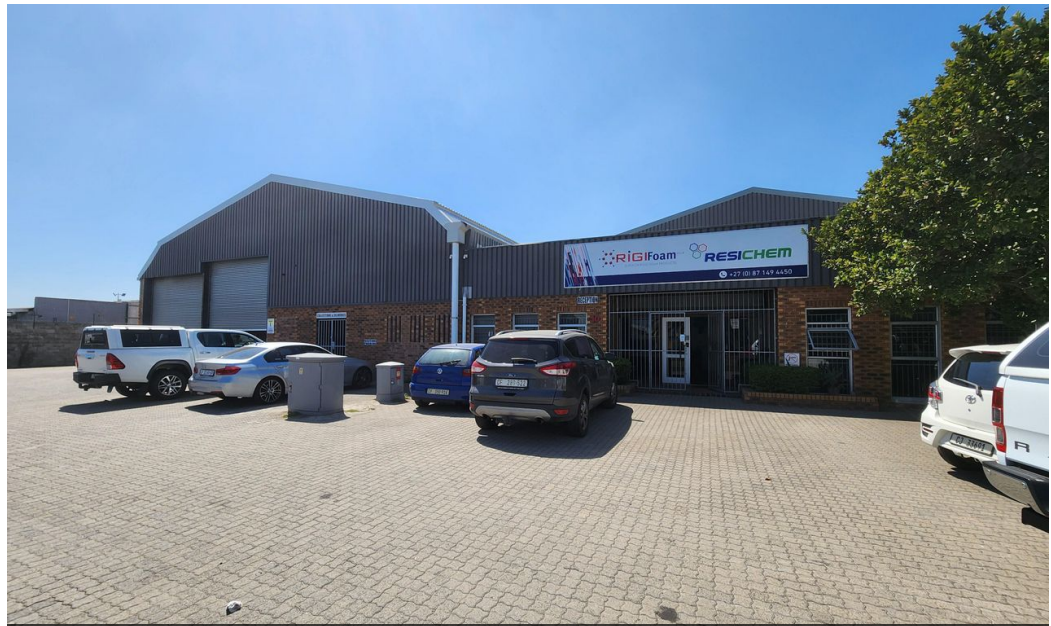
Web Ref CL18788