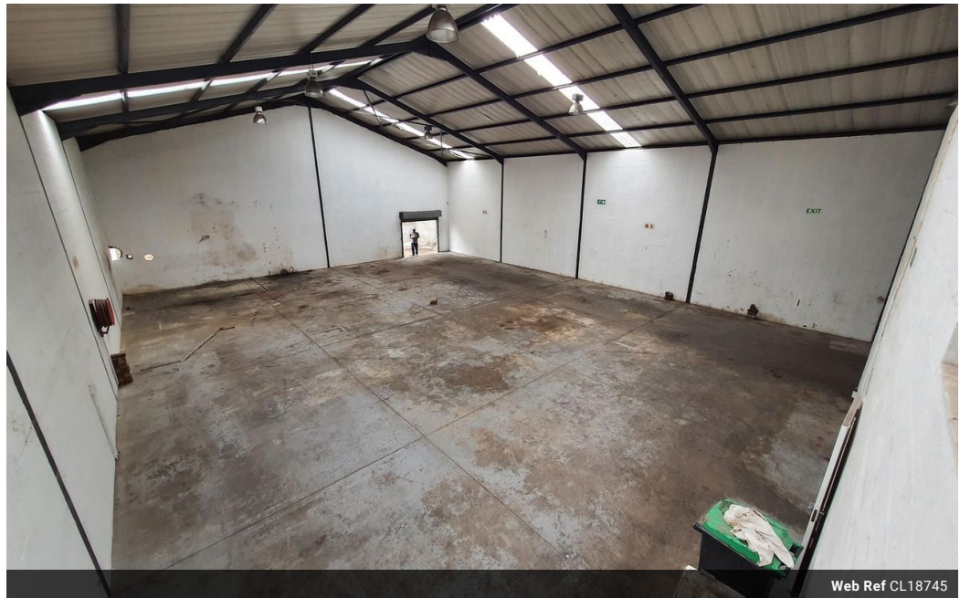
Web Ref CL18745