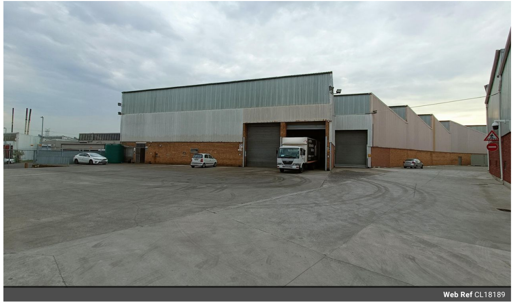
Web Ref CL18189