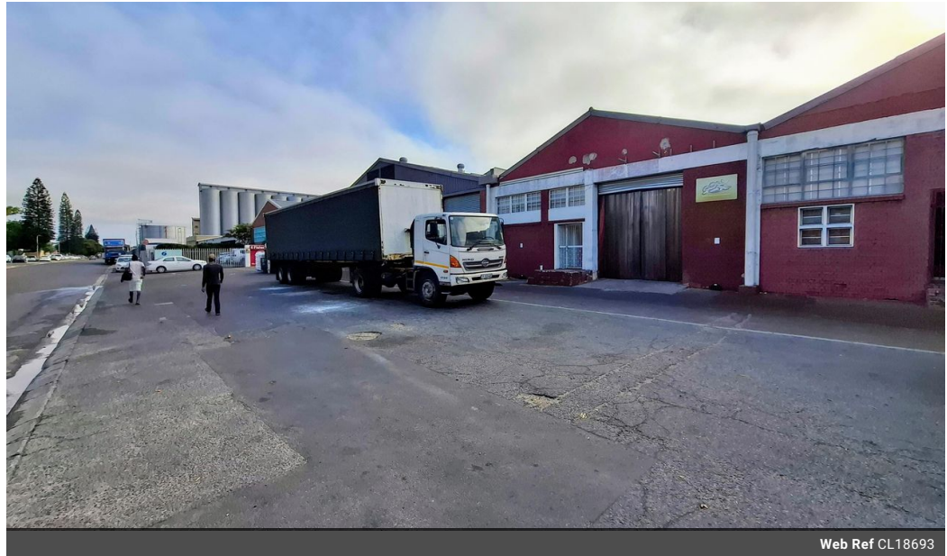
Web Ref CL18693