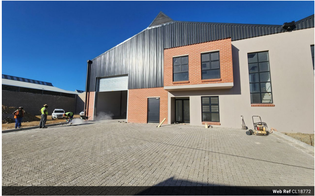
Web Ref CL18772