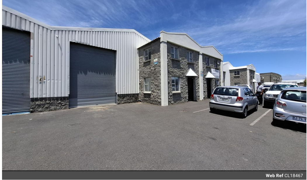
Web Ref CL18467