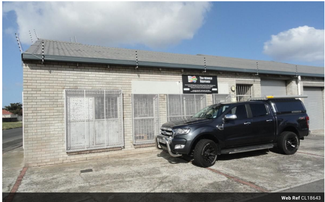
Web Ref CL18643