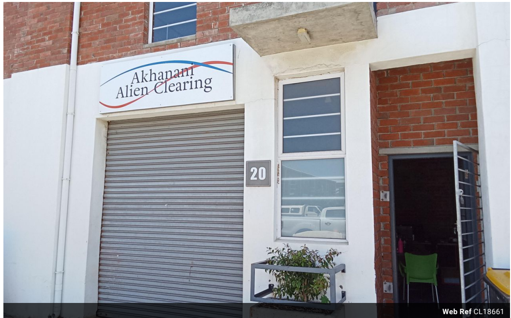
Web Ref CL18661