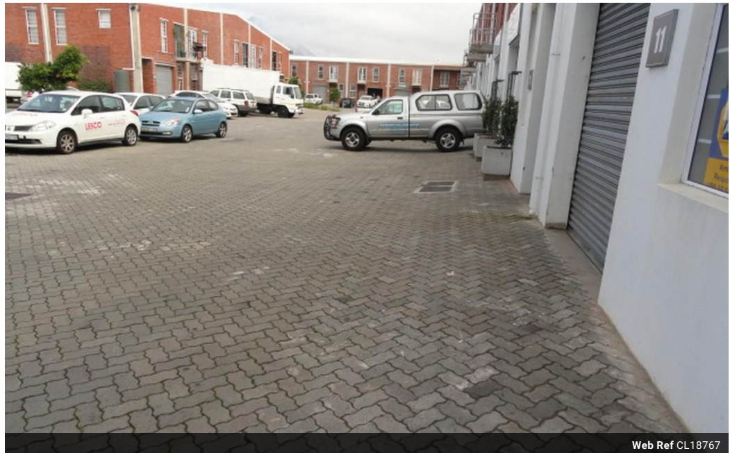
Web Ref CL18767