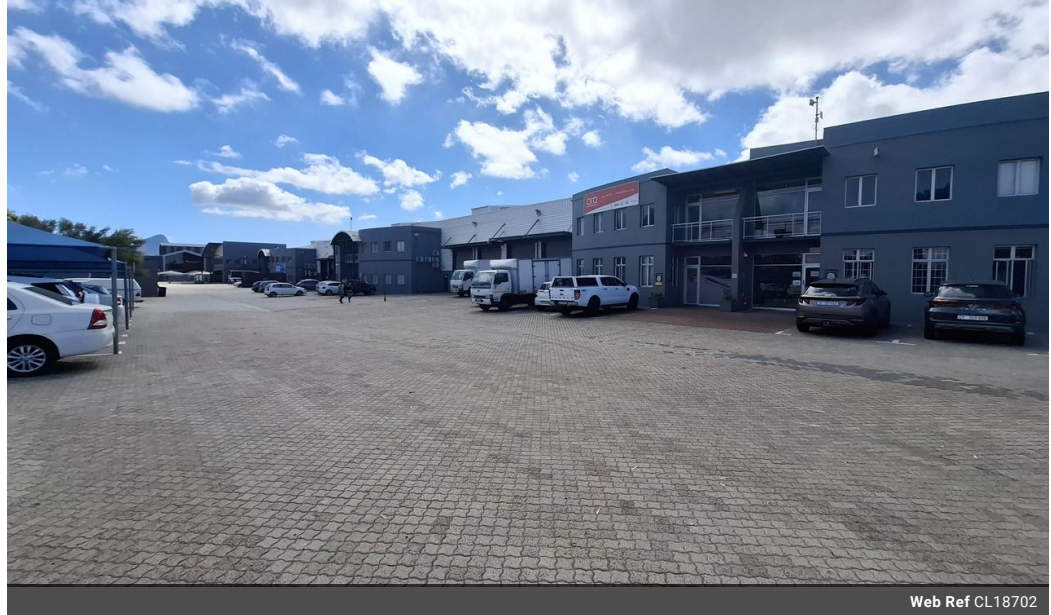
Web Ref CL18702