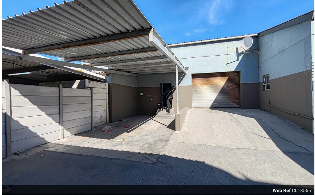
Web Ref CL18555