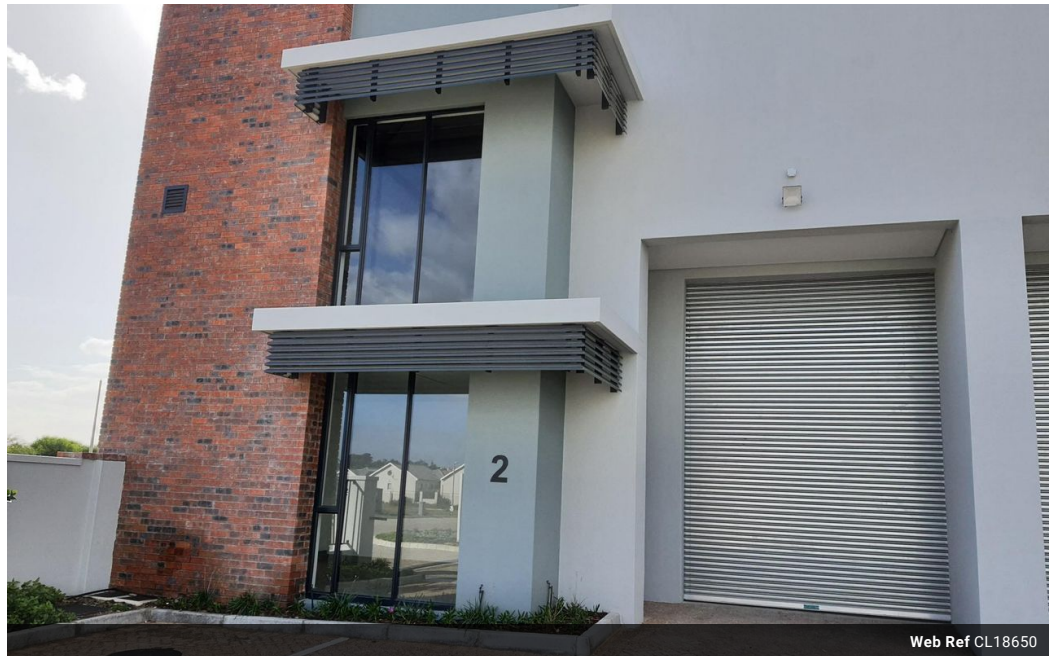
Web Ref CL18650