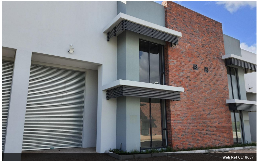
Web Ref CL18687