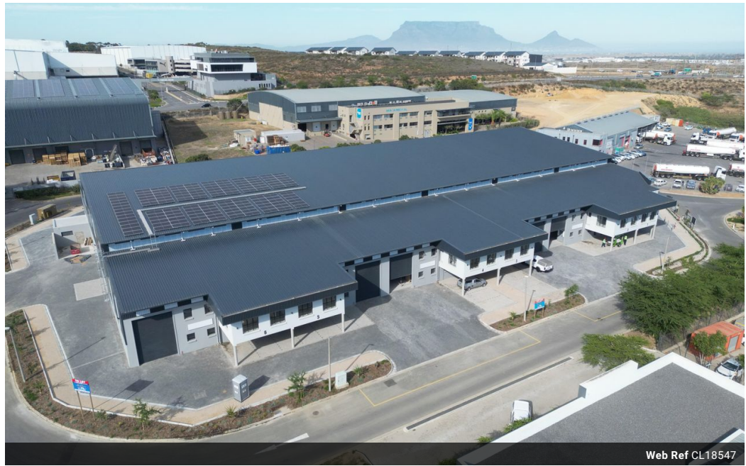
Web Ref CL18547