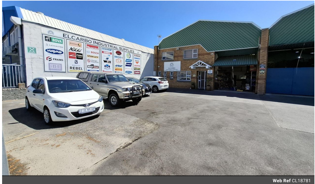
Web Ref CL18781