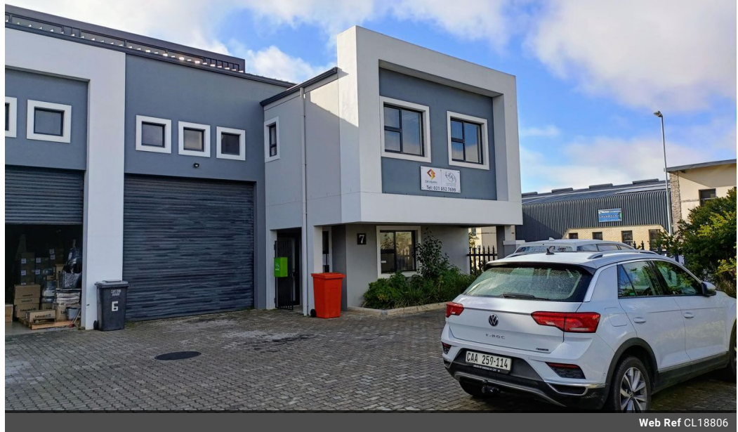
Web Ref CL18806